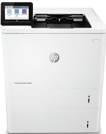
HP LaserJet Enterprise M609x