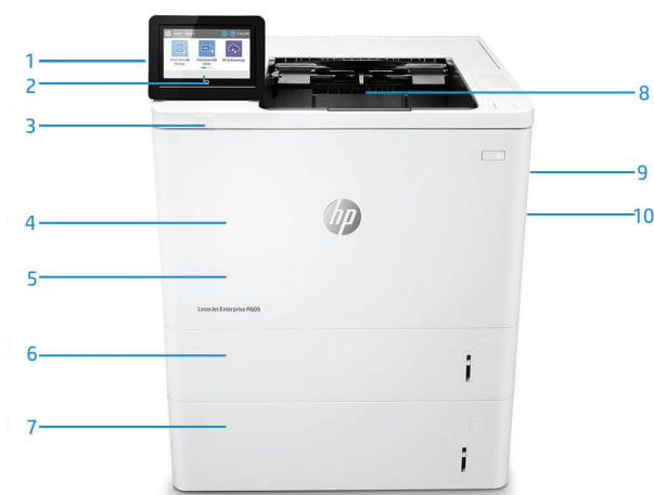
HP LaserJet Enterprise M609x